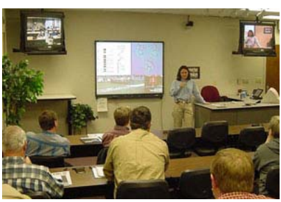
Recent cattle production short courses have been offered through distance education statewide.

If you missed part or all of either the recent Mississippi Cattle Reproduction Short Course or the Cattle Nutrition Short Course held in August 2004, now you can see what you missed. Both short courses were taped and will be available in mid-February 2005 on CD-ROM. Also included on the CDs are copies of the course PowerPoint presentations and handouts. Anyone interested in a copy of the cattle short course CD can request one for $5 per copy by calling 662-325-3516 or by filling out the request form below.