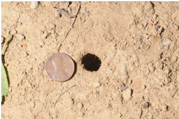
Emergence hole of a periodical cicada nymph. In suitable habitat there may be dozens of holes per square foot.

More Information: To learn even more about periodical cicadas check out http://www.magicicada.org/magicicada_2015.php . This web site is devoted solely to periodical cicadas and contains information and distribution maps for all know broods, including both 13-year and 17-year broods.