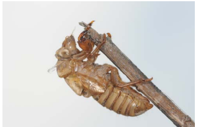
Cicada nymphs molt into adults soon after emerging from the ground, leaving their empty nymphal skins behind.