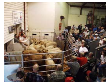
Up-to-date cattle and feed market information is offered in Cattle Market Notes each week.