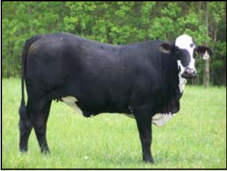
Good heifer development helps ensure optimum reproductive efficiency.