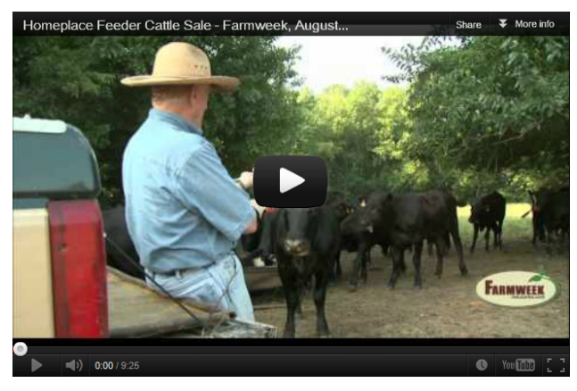
Check out the Farmweek television feature of the Mississippi feeder calf board sales on YouTube by visiting the website listed above