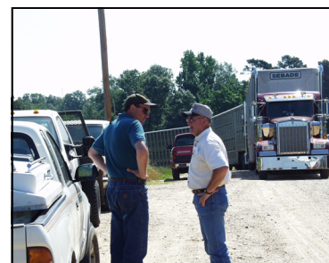
The Beef Mythbusters Workshop will address some common beef cattle production myths with science-based information and recommendations

“...Myths addressed will include genetics, reproduction, nutrition, harvest, health, marketing, and environmental impact topics.”