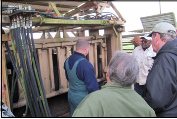
The MS/LA Beef and Forage Field Day to be held in Tylertown will feature demonstrations with live cattle