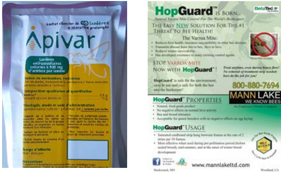
Figure. Two miticides given Section 18 status for use against Varroa mites in MS during the upcoming year. Apivar® is an amitraz formulation from a French company (the label will be in English for the U.S. consumer). HopGuard® is a natural product formulation of beta acids derived from hops.

For additional information, beekeepers may contact the Bureau of Plant Industry at (662) 325-3390 or toll-free at 1-888-257-1285.