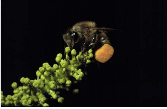
Figure. Honey bees collect pollen for food, and in so doing, they pollinate many agricultural crops. A recent study by Nick Calderone estimates that pollination by bees contributes $29 billion dollars to agricultural production.

In 2006-07, beekeepers experienced heavy losses to their colonies. While mites appear to be the cause of roughly 70 percent of the losses, the remaining losses (referred to as colony collapse disorder) are not fully understood, with possible explanations including pesticide use, beekeeper management practices, climate change and other pathogens, reports the paper.