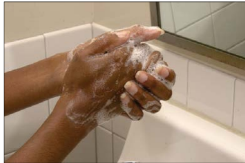
4. Clean under fingernails and between fingers.