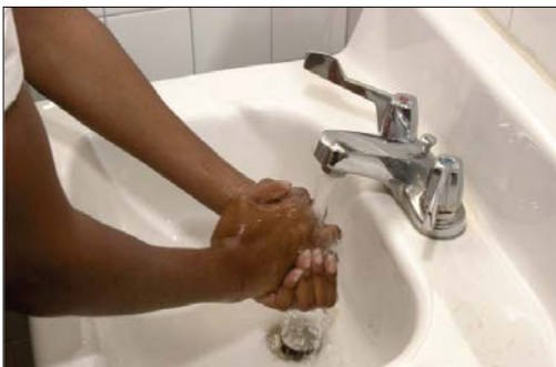
5. Rinse hands thoroughly under running water.