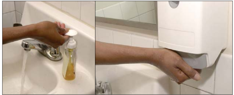
2. Apply soap.