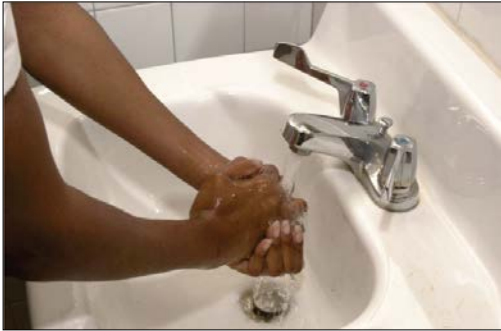
1. Wet your hands with warm (110°F), running water.