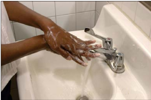
3. Rub hands together for at least 20 seconds.