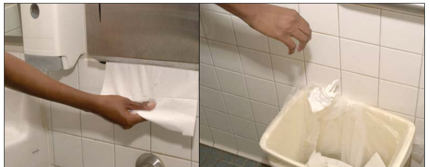
6. Dry hands. Throw the towel in a trash can.