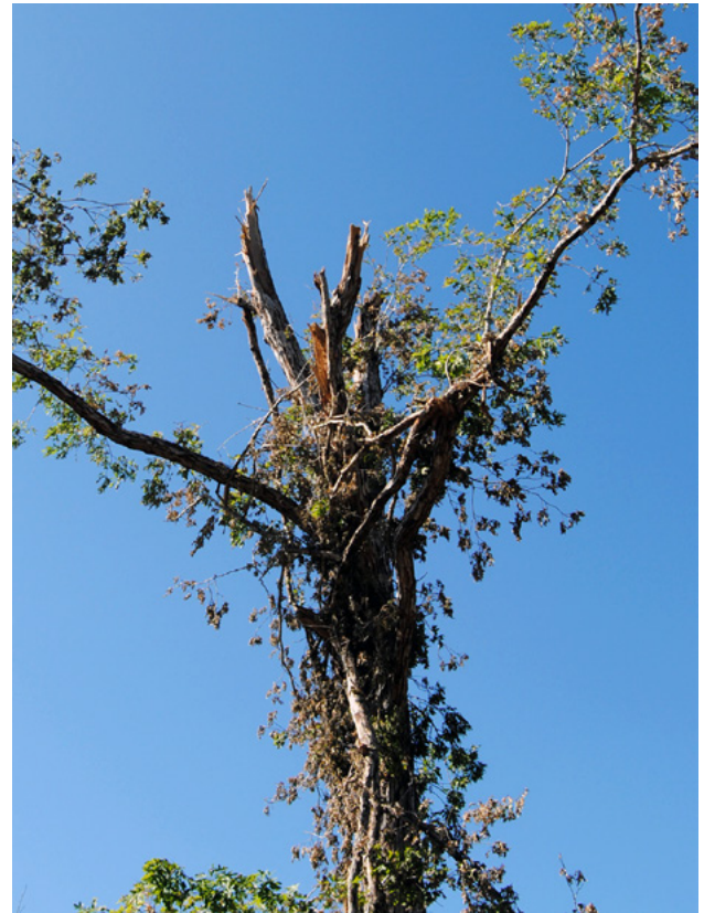
Figure 4. The crown of this hardwood tree shows considerable breakage (greater than 75 percent), so the chance of recovery is very low.