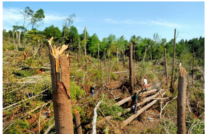
Figure 2. This hardwood stand shows primarily broken stems.