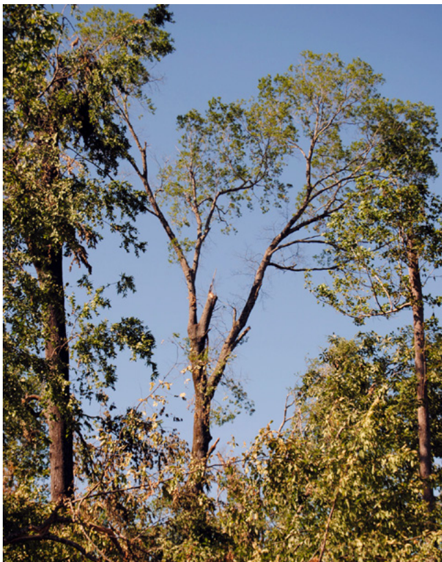
Figure 3. The crown of this hardwood tree shows limited breakage (less than 50 percent of the crown), indicating a probable full recovery.

Boles of standing trees can be severely wounded by falling trees and objects blown during tornados or straight-line winds. These wounds can result in degradation of stems but usually do not result in immediate death of the tree. Except in the case of very severe wounds, trees will continue to grow and remain an important component of stands that can be managed following damage.