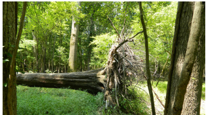
Figure 1. This windthrown hardwood illustrates the depth of soil and rooting zone in comparison to the stem.

High-speed tornado winds can cause stem breakage, especially in younger hardwood trees, as shown in Figure 2. Broken stems in mature hardwood trees often occur at weak areas such as forks or previous injuries that have begun to decay. Broken stems result in far greater value loss in hardwood sawtimber than does windthrow. Splintering, fiber pull, and reduction in merchantable length all limit use of the tree for higher value products such as lumber and veneer. Also, logging cost for salvage is greater when trees are broken.