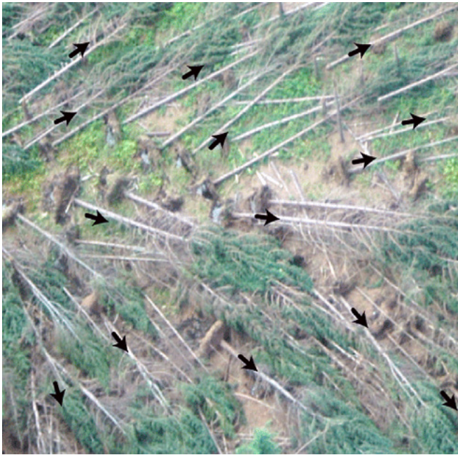
Figure 6. Straight-line winds result in a uniform pattern of windthrow, which makes salvage operations less expensive.