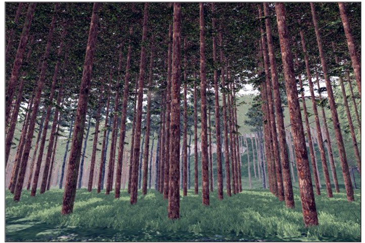
Figure 2. There is often a strong relationship between the basal area of a loblolly pine plantation and the amount of carbon being sequestered and stored within the overstory trees. Additionally, basal area is often a very good predictor of understory biomass. If there is a strong relationship (or strong correlation) between basal area and carbon, then by knowing basal area per acre, you essentially know carbon per acre. We can use this to our advantage. Basal area can be quickly obtained using variable-radius sampling protocols, and then a regionwide carbon-basal area ratio (CBAR) can be used to estimate carbon per acre in the trees.

This publication describes a quick and low-cost means of obtaining a carbon per acre estimate. It then shows how carbon per acre is mathematically converted into metric tons, as well as how carbon is converted into metric tons of carbon dioxide equivalents (MtCO 2 e) by using basic assumptions about the chemistry of wood. By using variable-radius sampling, we can take advantage of relationships between tree stem growth and carbon production, to ultimately estimate carbon per acre.