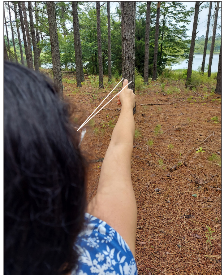
Figure 3. A thumb can be used to project an “imaginary” horizontal angle, which can be equated to a basal area factor (BAF). If you extend your thumb some distance from your eye, assuming the vertex of the angle (where the angle begins) is located in your eye, then an imaginary horizontal angle is projected out to your thumb and beyond (depicted on the right). This is the same approach used for stick angle-gauges, Cruz-All tools, etc. Depending on the width of your thumb and your arm distance, you can use this approach to generate your own BAF. Whenever the width of the thumb is smaller than the tree image at 4.5 feet above the ground (diameter at breast height) the tree is “in.” To obtain basal area per acre, just multiply the number of “in” trees at each point by your thumb-specific BAF.